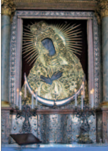
■ Mother of Mercy in Ostra Brama, Vilnius, Lithuania

The people of Vilnius have venerated Our Lady of Ostra Brama known as the Mother of Mercy and Gate of the Dawn since the 16 th century. In the 18 th century the image was officially declared miraculous and in 1735 her feast was solemnly celebrated for the first time. It was crowned in the name of the Pope in 1927. Thousands of healings have been testified to by the thanksgiving gifts, which adorn the walls. It is known all over the world and Saint John Paul II visited the shrine on 4 th September 1993. There is a replica of this icon in St Paul's Basilica in Rome and it was to Our Lady of Mercy that Pope John Paul went to pray after his election as pope. The only parts of the ancient walls of Vilnius, which still stand, house this shrine to the Mother of God. Etched into the wall is the invocation " Mother of Mercy we call on your Defence ". The shrine overlooks the main entrance into the city of Vilnius and Our Lady is honoured as the protectress and defender of Vilnius. Every year there is an annual pilgrimage from the Gate of the Dawn to the Shrine of the Mother of Trakai, the patroness of all Lithuania. Many pilgrims walk barefoot as a testimony