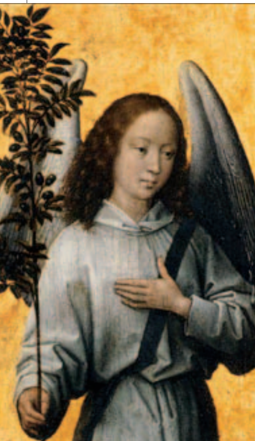
■ Angel with an olive branch by Hans Memling, c. 1475-1480

The original 40 Statutes were difficult for a good number of ordinary laypeople with work, family and other commitments; however they very much wanted to become a Knight. Many people were already doing 80% of the requirements, such as daily Bible reading, the daily exorcism prayer to St Michael, the daily angelic chaplet to St Michael, fasting each Friday on bread and water or a good deed if a fast is impossible, monthly reconciliation, monthly Eucharist Adoration and once a year the Nine day Novena to St Michael on 29 th Sept. Due to the interest in many people wanting to become Knights of St Michael, the Superior General of CSMA in August 2013 decided to make this a devotion, therefore making it possible for every layperson in any country in the world to become a Devotional Knight of St Michael. In the new booklet on The Devotional Knighthood of St Michael, published in Feb 2014 people can read all about the knighthood.