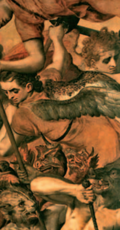
■ Fall of Rebelious Angels by Frans Floris, 1554