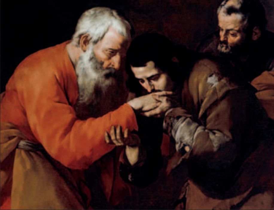
■ The Return of Prodigal Son, Neapolitan School c. 1630

the prodigal son. The father's fidelity to himself is totally concentrated upon the humanity of the lost son, upon his dignity. This explains above all his joyous emotion at the moment of the son's return home.