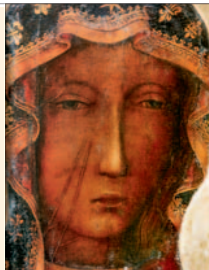
■ Our Black Madonna in Czestochowa, Poland

Single room supplement £140 / €165 / $225