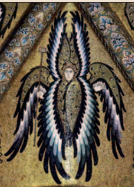
■ Mosaic of a seraphim in the Cathedral of Cefalu (1145-60)

For a start, he decidedly rejects the earlier exegeses of other Church Fathers, who claimed that the two seraphim surrounding God the Father are Jesus Christ and the Holy Spirit. In various New Testament passages, Christ is shown as the King of Glory surrounded by angels, which is how He also appears in Isaiah's vision. Jerome also explains the nature of the seraphim, as the word "seraphim" means "embers" or "fire", implying that the sacred is