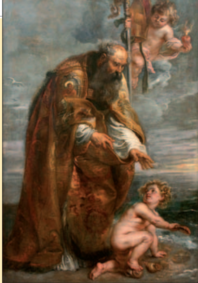
■ St Augustine by Peter Paul Rubens, 1639

...For when God said, "Let there be light, and there was light," if we are justified in understanding in this light the creation of the angels, then certainly they were created partakers of the eternal Light which is the unchangeable Wisdom of God, by which all things were made, and whom we