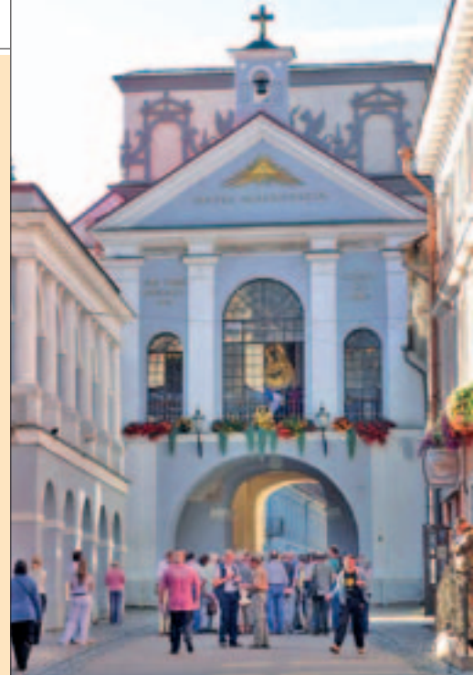
■ Ostra Brama, Vilnius, Lithuania

Morning Mass at Church of John the Baptist 12 Bonifraterska Street,